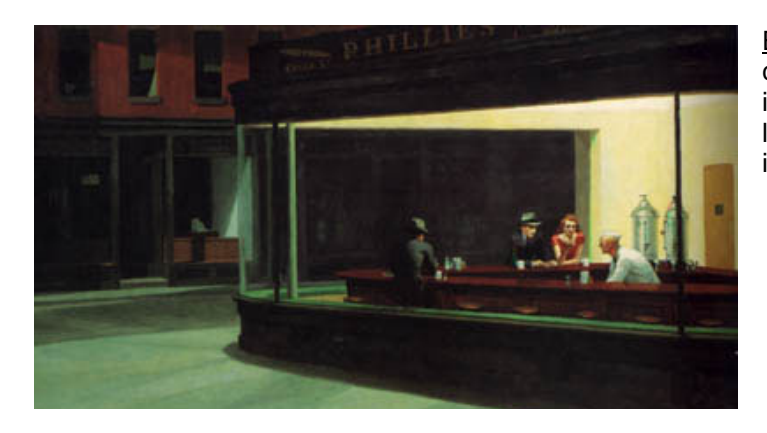
<u>Edward Hopper</u> – A realist of the early 20<sup>th</sup> century; focused on distinctly American images of society; subjects included loneliness and isolation; most famous work is Nighthawks .