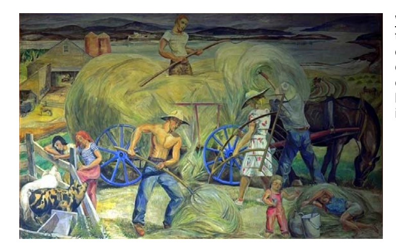
<u>WPA Art</u> – Artistic works commissioned by the Works Progress Administration, designed to give jobs to artists willing to create works for public consumption; emphasized classic American values of hard work and ingenuity; example shown is Hay Making by Marguerite Zorach.

<u>Grant Wood</u> – Most famous for his painting American Gothic , a depiction of agrarian Americans at the beginning of the Depression Era.