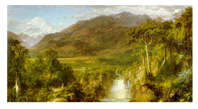
<u>Hudson River School</u> – Distinctly American movement in art in the mid-19<sup>th</sup> century; focused on large landscapes and natural settings; artists included Thomas Cole and Frederic Edwin Church.