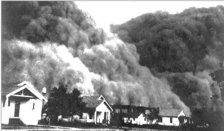
Photograph of dust cloud enveloping neighborhood, 1933

“Let the workers organize. Let the toilers assemble. Let their crystallized voice proclaim their injustices and demand their privileges. Let all thoughtful citizens sustain them, for the future of Labor is the future of America.”